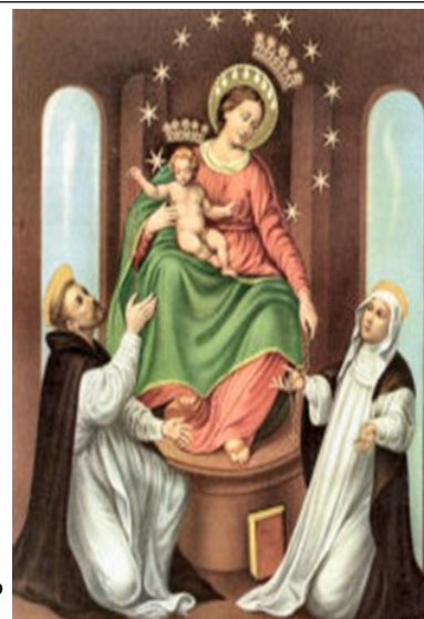
Our Lady of the Rosary with St. Dominic and St. Catherine

"The traditional image of Our Lady of the Rosary portrays Mary who with one arm supports the Child Jesus and with the other is offering the rosary beads to St Dominic. This important iconography shows that the Rosary is a means given by the Virgin to contemplate Jesus and, in meditating on his life, to love him and follow him ever more faithfully. It is this message that Our Lady has also bequeathed to us in her various apparitions. I am thinking in particular of the apparition in Fatima that occurred 90 years ago. Presenting herself as 'Our Lady of the Rosary,' she insistently recommended the daily recitation of the Rosary to the three little shepherd children, Lucia, Jacinta, and Francisco, in order to obtain the end of the war. Let us also accept the Virgin's motherly request, pledging to recite the Rosary with faith for peace in families, nations, and throughout the world."