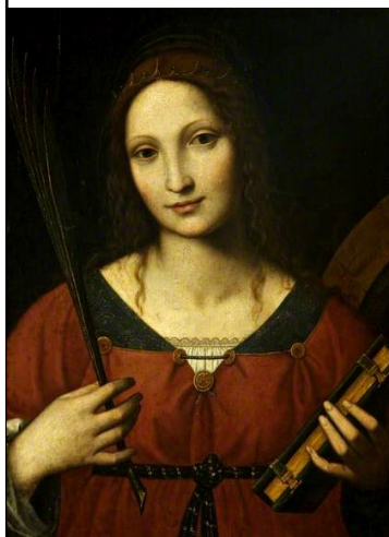
St. Catherine of Alexandria, by Bernardino Luini

According to the Legend of St. Catherine , this young woman converted to Christianity after receiving a vision. At the age of 18, she debated 50 pagan philosophers. Amazed at her wisdom and debating skills, they became